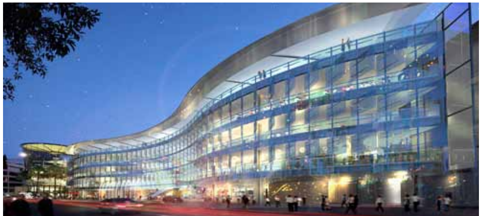
Artist's impression - Star City Redevelopment

Interestingly, the total budget for all the separate parts of the project has been set at a figure that, when you add up all the individual digits, you are left with only one digit (digital root). This digit is the number 8, a lucky number in Chinese culture. With this level of planning, it is fair to say that there are absolutely no gambles being taken with this development.